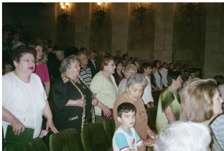
Congregation of Evangelical Church of Yerevan