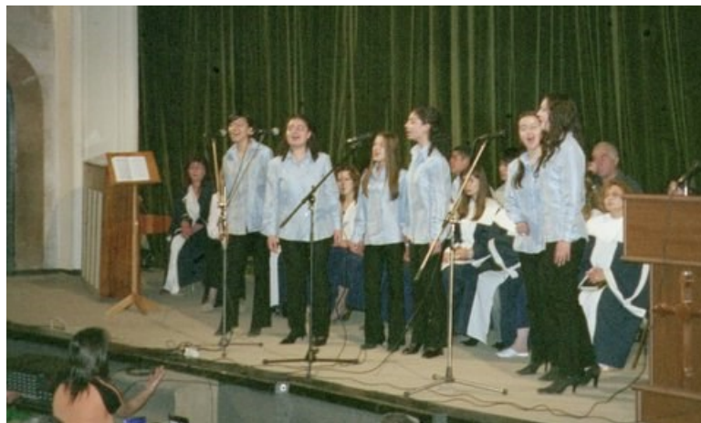
Yerk Yerkots group of Evangelical Church of Yerevan