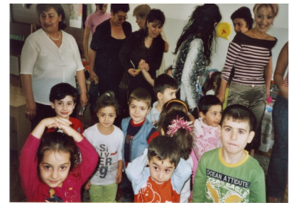
Kindergarten Children of Avedisian School