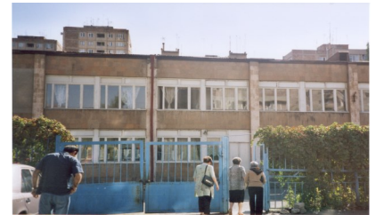
General View of Avedisian School

We were privileged to visit the first Armenian Evangelical day school (see picture) "The Khoren and Shoushanig Avedisian Primary School", established in 1998 in the south-west Malatia section of Yerevan (otherwise called Bangladesh area).