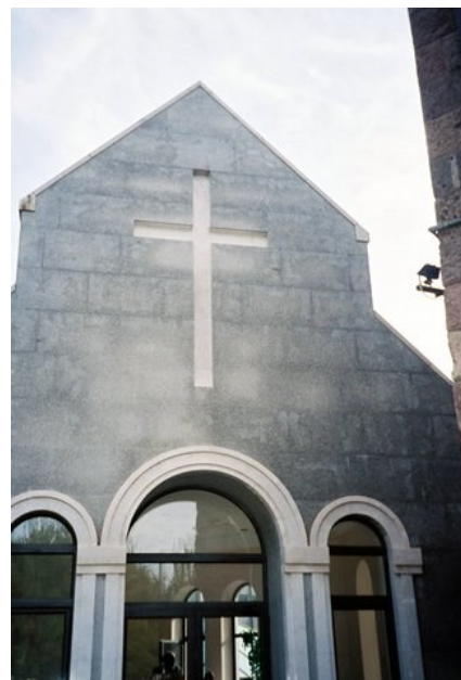
Entrance view of the Evangelical Church of Yerevan