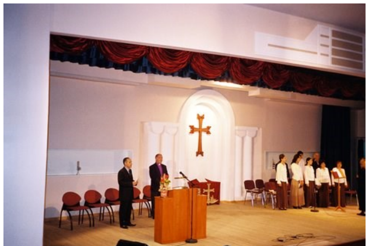
View of the pulpit of the Evangelical Church of Yerevan

Calvary Church has been financially supporting and praying for the following three fellowships: