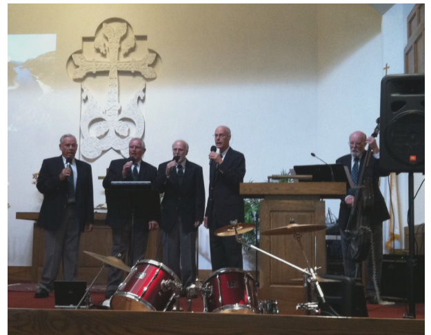
Covenant Four Quartet sang in our Service Sunday, September 23rd It was a blessing for all of us.